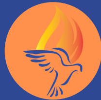
St. Francis Xavier Fund for Missionary Parishes