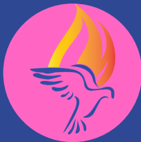
St. Therese Fund for Evangelization