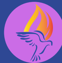
St. Elizabeth Ann Seton Fund for Catholic Schools